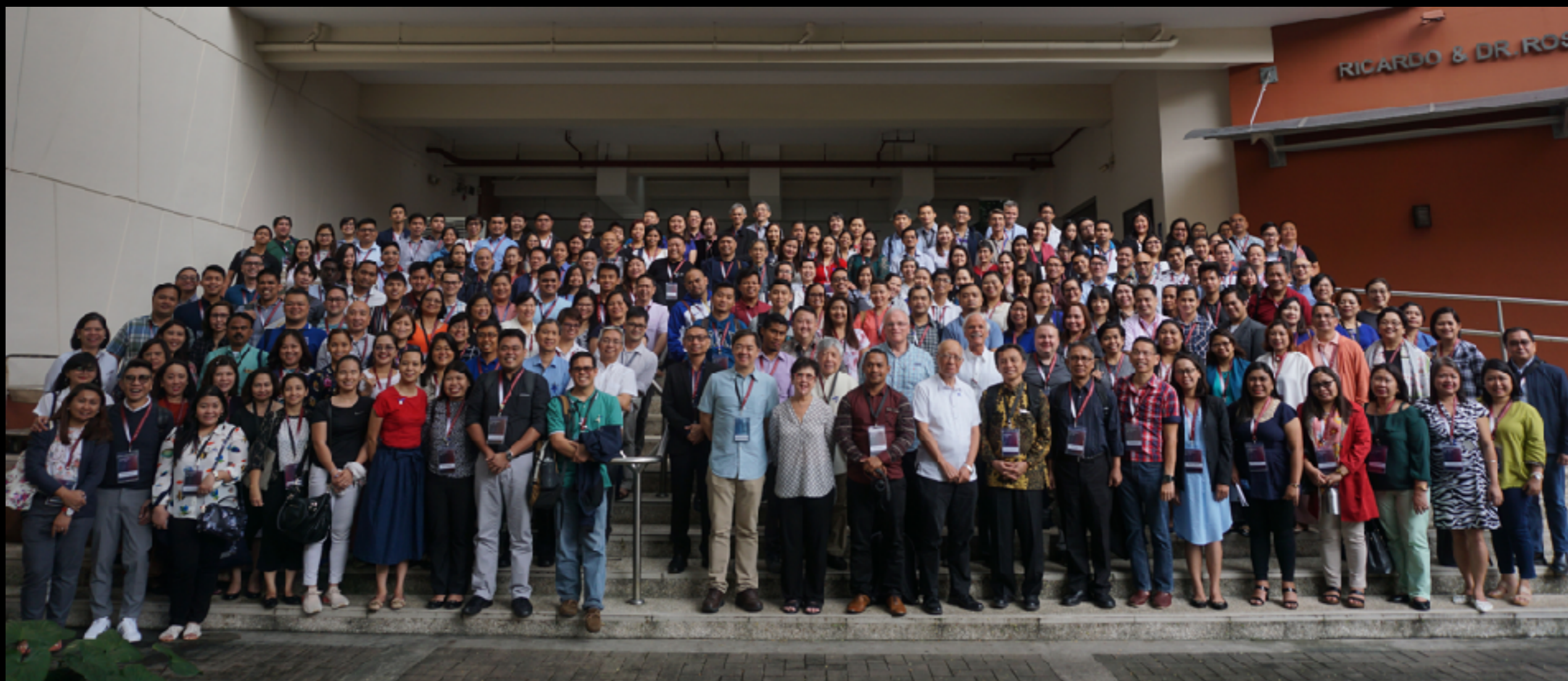
12 Presentors came from JBEC Present were 140 faculty and administrators from JBEC