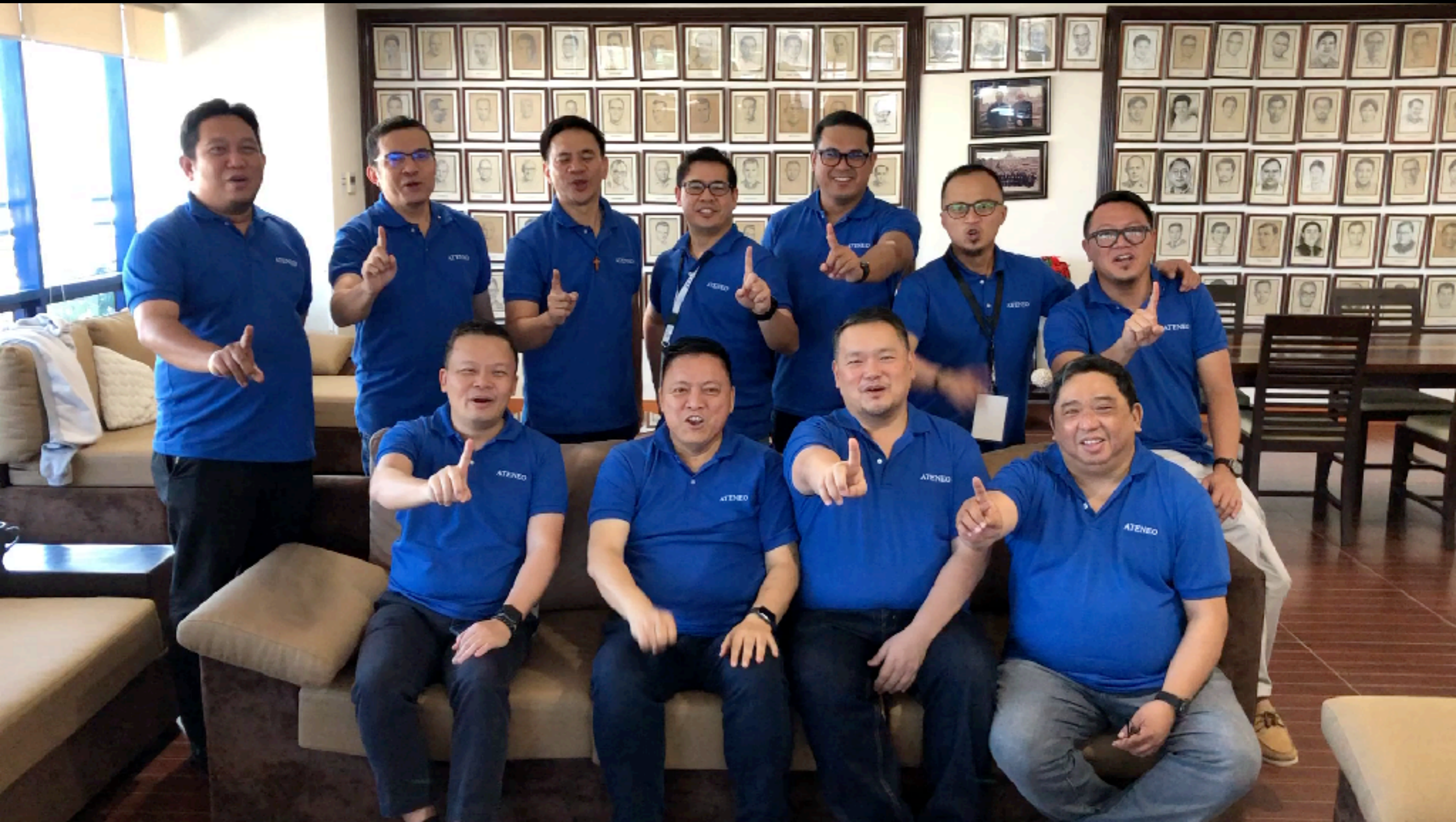
Meeting of Jesuits in the Basic Ed