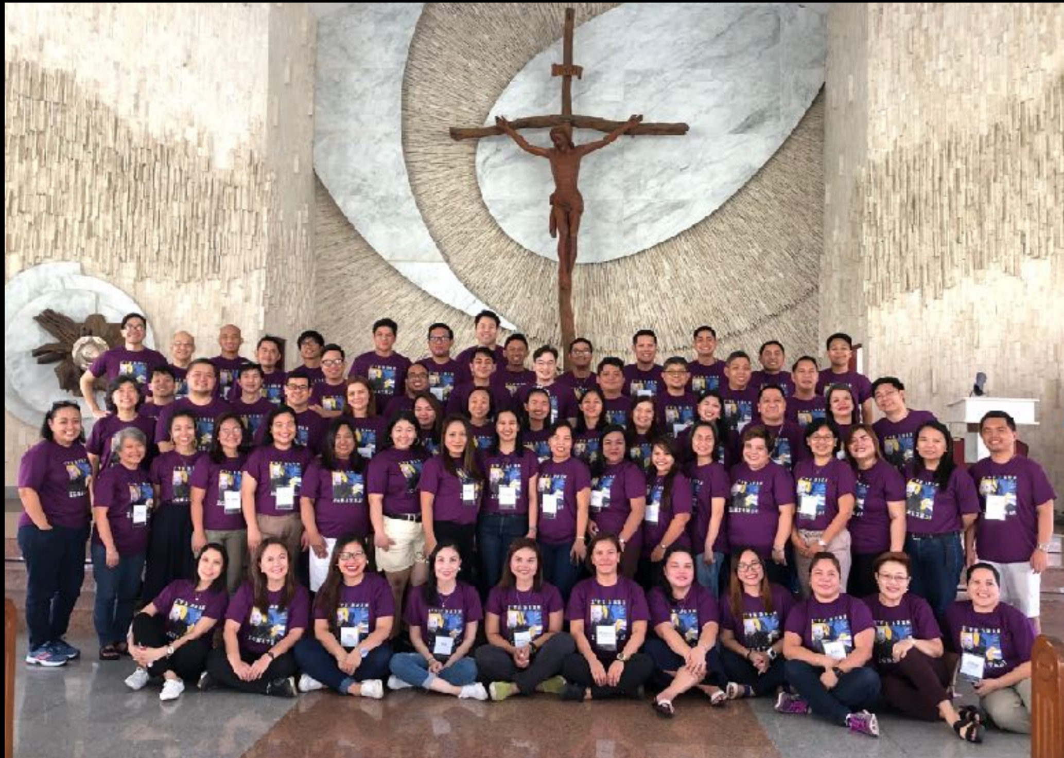
Largest WISL so far with 56 participants from 9 schools accompanied by 9 small group facilitators and 2 main facilitators