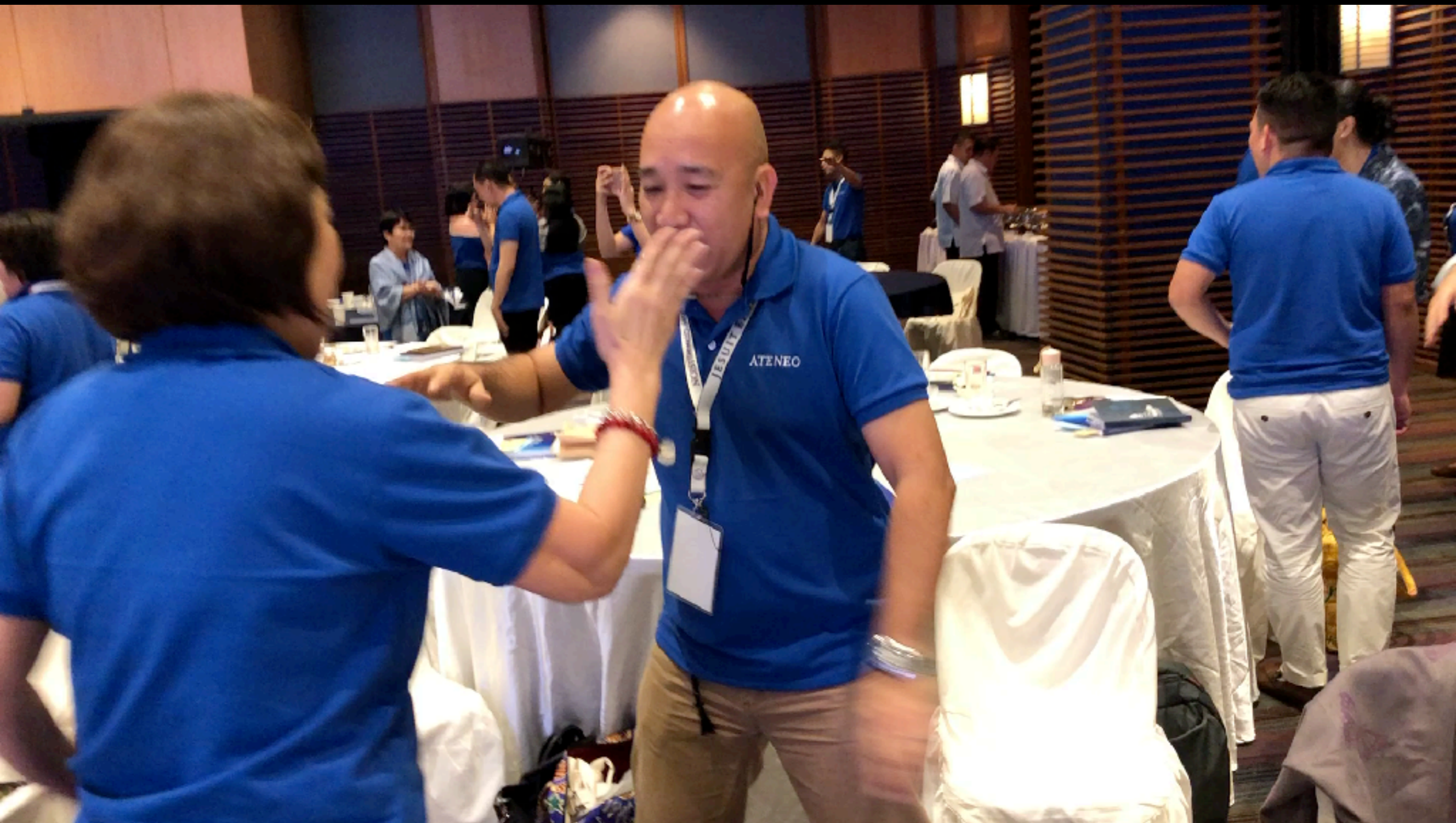
Light moments for JBEC Principals