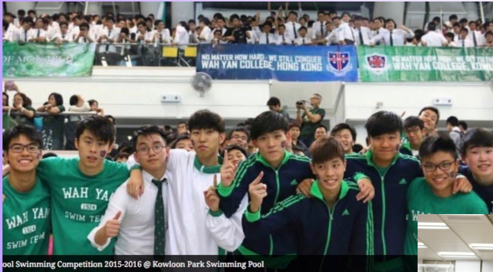
ool Swimming Competition 2015-2016 @ Kowloon Park Swimming Pool